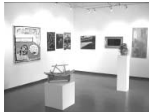
Performance Indicators - installation shot